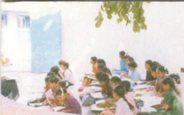
Creating a home for the less privileged