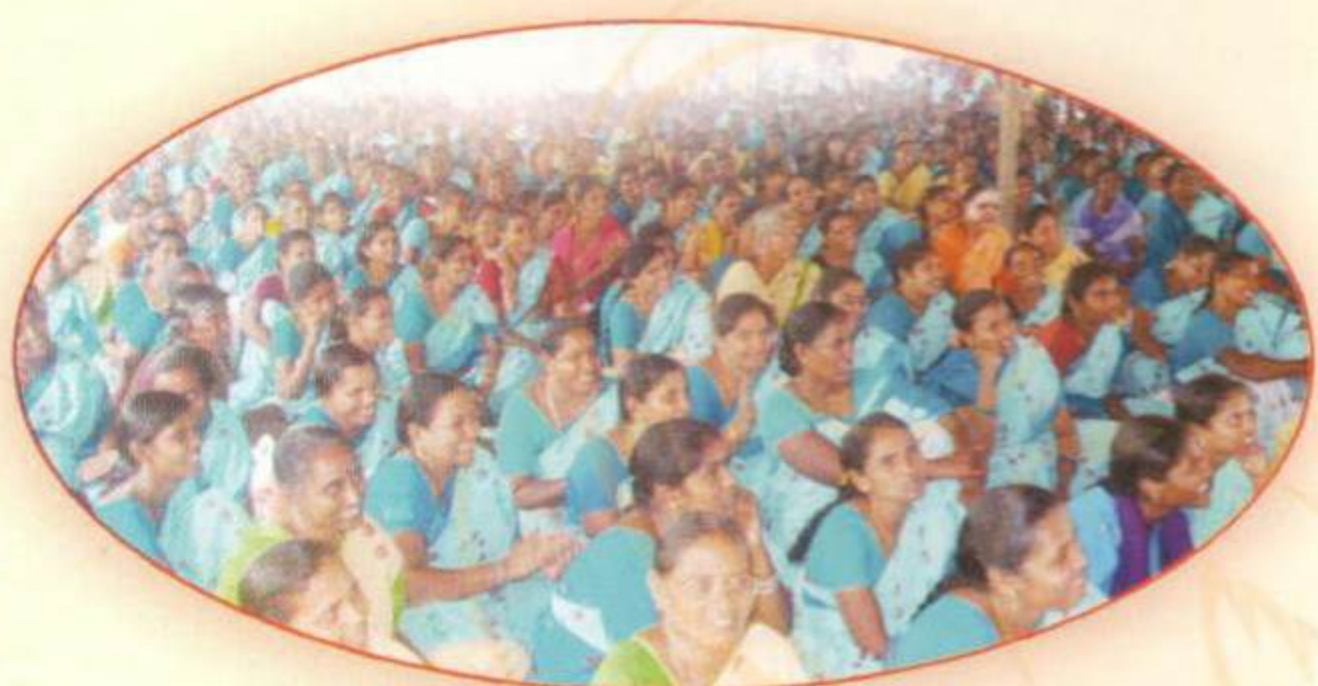
Capacitating rural women towards sustainable livelihood

6. Care and Support: State Govt Scheme, The AIDS Department, Hyderabad.