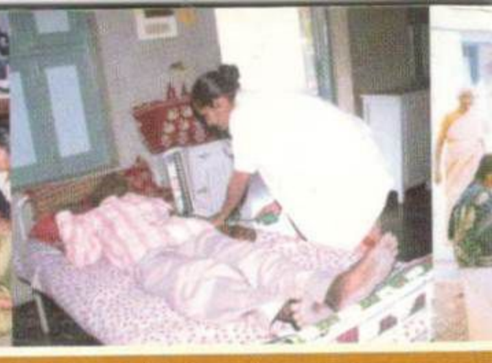
Empowering women through adult education