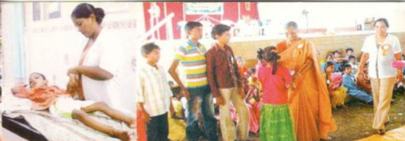
Reaching out to the differently abled children