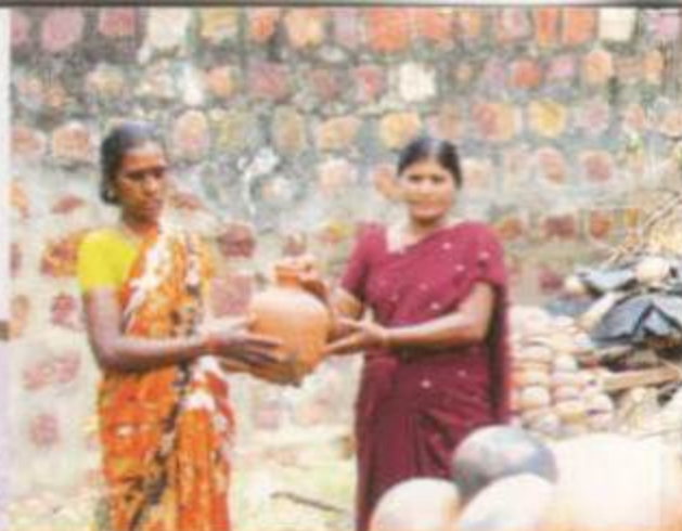
Making women successful entrepreneurs in the society